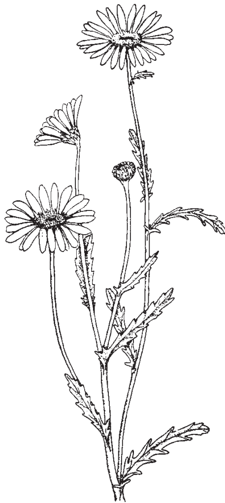
Figure 1. Oxeye daisy stems, leaves and flowers

Oxeye daisy is a perennial member of the Asteraceae family, the same family as sunflower ( Helianthus annuus ). Oxeye daisy looks like the typical daisy. Flower heads are borne individually on the tops of long slender stems. Flowers are 1.5 to 2 inches across, with yellow centers, and 20 to 30 white petals radiating from the center (Fig. 1). The petals are slightly notched at the tip. Stems grow 1 to 3 feet tall and are smooth, frequently grooved and sometimes branch near the top. Leaves progressively decrease in size upward on the stem. Basal and lower leaves are lance-shaped with "toothed" margins and petioles that may be as long as the leaves. The upper leaves are alternately arranged, narrow and often clasp the stem. Seeds are brown to black in color, 1/16 of an