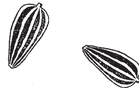
Figure 2. Seeds have 8 to 10 white ridges down the side

Oxeye daisy flowers in June through August. The plant is a prolific seed producer; a single, healthy, robust plant produces up to 26,000 seeds. Reproduction occurs primarily through seed dispersal and germination, although spreading rootstalks contribute to its propagation. Seeds may be viable ten days after the flower blossoms and are dispersed close to the parent plant. Germination occurs throughout the growing season, but most new seedlings emerge in spring. Seeds that do not germinate in the